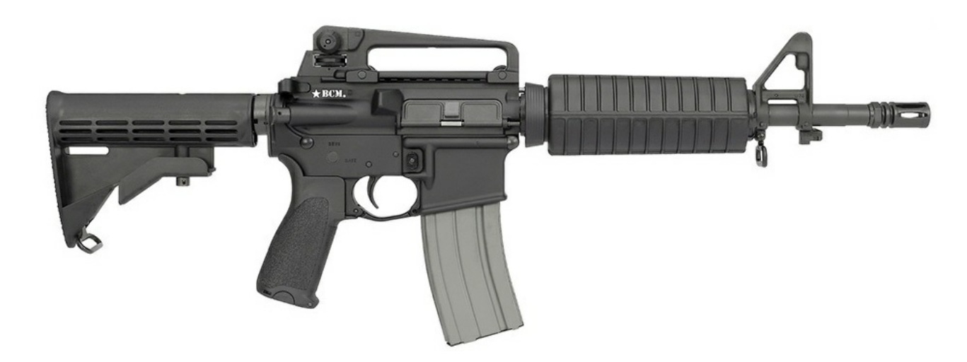
AR-15 style rifle, fully assembled