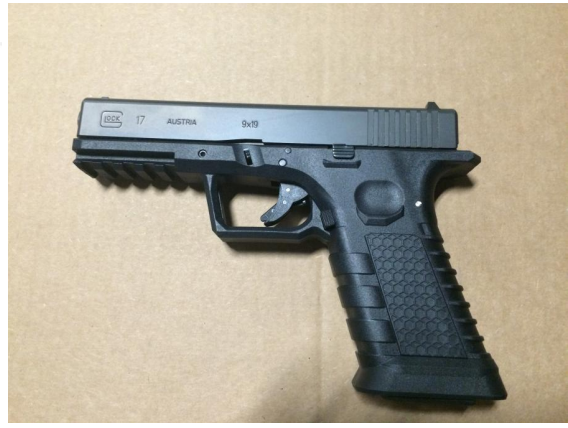
Polymer80, model PF940C (ver. 2) frame with a Glock 19 slide Glock 17 slide