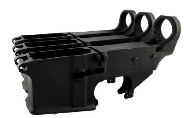
80% lower receivers (not machined or drilled out, nota firearm)